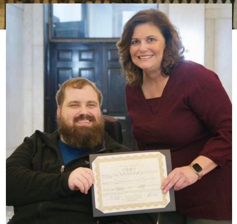
Above: The Lawrence County Commissioners recognized DD Awareness Month with a special proclamation at their March 6 meeting.

Many of our counties held watch parties for the Kickoff of DD Awareness Month which took place at the Ohio Statehouse. Pictured above is the watch party at the Scioto County board and to the right is the Pickaway County board watch party.